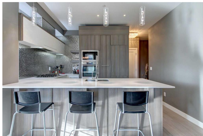
308-119 19 St NW, Calgary, AB

Welcome to Savoy by Truman Homes, where urban convenience meets contemporary style! Nestled in the heart of Kensington West, this vibrant community offers an incredible lifestyle—step outside to explore charming boutique shops, restaurants, bistros, and delis. Enjoy easy access to transit, the Bow River pathways, Kensington Village, and downtown, plus a well-established neighborhood with schools, parks, playgrounds, and more! This bright and unique corner unit boasts south east-facing exposures, flooding your space with natural light. Step into a welcoming entryway with a closet, leading you to a sleek, modern kitchen featuring high-end appliances, quartz countertops, and custom cabinets. The open layout flows effortlessly into the dining and living areas, the perfect spot to relax, with access to the south-facing balcony. The spacious primary bedroom features a luxury ensuite pampering you with a deep soaker tub, a large standing shower, and a stunning Kohler glass vessel sink. The flexible second bedroom is thoughtfully placed on the other side of the unit for added privacy. The spa-inspired main bathroom includes a huge walk-in shower and stylish glass vessel sink. Plus, the in-suite laundry offers additional storage and organization. Enjoy the added perks of a rooftop patio, secure titled underground parking, a separate storage locker, and bicycle storage. This stunning home is move-in ready—come experience the best of Kensington living today!